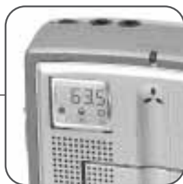
LCD Tape Counter displays recording time elapsed