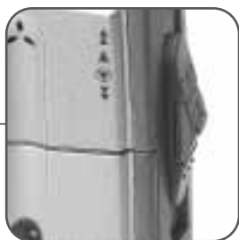
4-Position Switch for one-handed operation